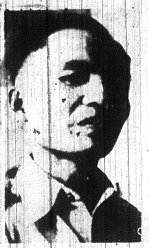
Rebel Luis Taruc

"Taruc had no alternative but to surrender," Magsaysay commented.