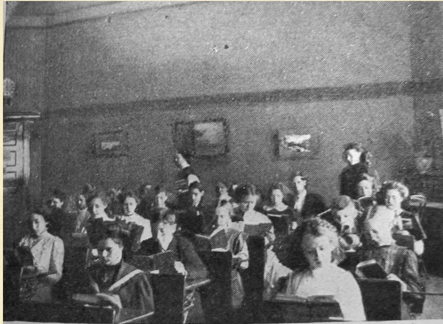
Some of the seventh-grade pupils who wrote opinions of the books they had read